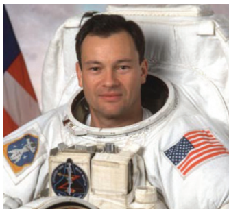
Michael López-Alegria, Spanish American Member of the technical advisory board