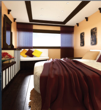
H48 "SPACE GRACE & PACE"