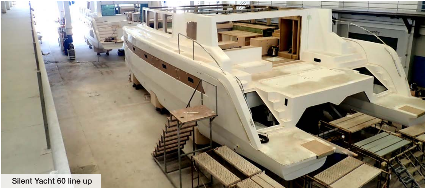
Silent Yacht 60 line up