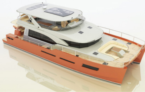
H70 "OPEN SKY"