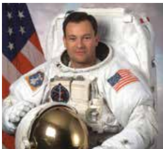
Michael López-Alegria, Spanish American Member of the technical advisory board